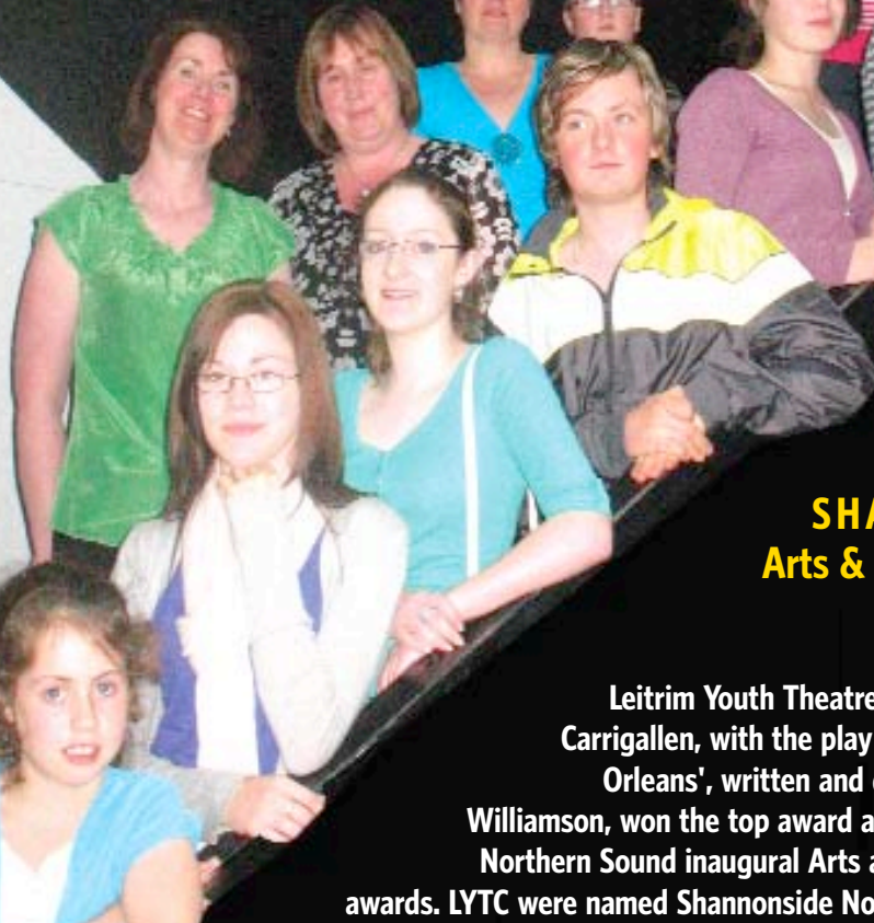
■ Right: with parents and family members at the award ceremony for the Shannonside Arts & Entertainment Awards in the Cavan Institute in Cavan town.