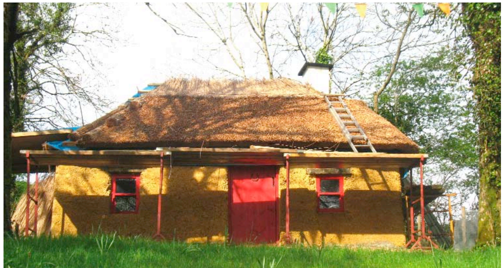
■ Below: The final re-furbished house of Margaret of New Orleans